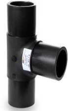
Tee Long Spigot

PN ratings from PN10 – PN25 Sizes range from: 25mm – 315mm