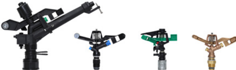
Impact Sprinklers — Available in Brass & Nylon | Sizes 15, 20 & 50mm Operating Pressure 1.7 - 4.1 Bar | Radius 8m - 30m Flow Rate 0.6 - 24 m 3 /Hr