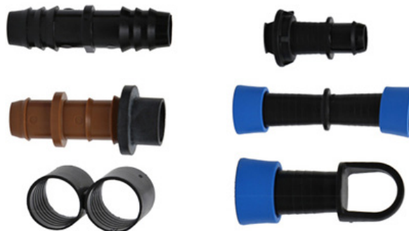
Connectors and Accessories

Dripper Spacing — 0.2m / 0.3m / 0.4m / 0.5m / 0.6m / 0.75m / 1m