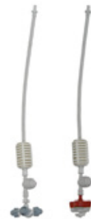
Coolnet & Spinnet [For Seedlings] Single & 4 Nozzles