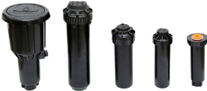
Sprinklers — Radius 0.9 m - 18 m | Flow Rate 0.35 - 4.9 M 3 /Hr | Pressure 1.7 - 4.1 Bar