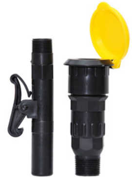
Turf Value & Turf Key 20mm & 25mm