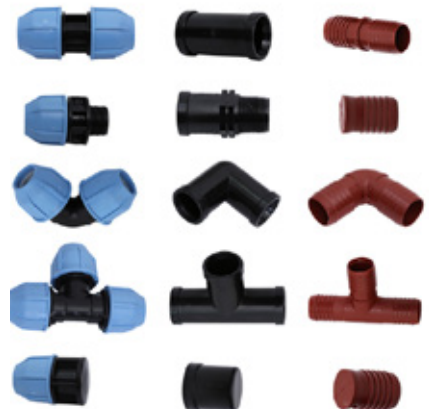
HDPE, Nylon and Full-Flow Fittings