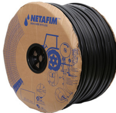
16mm Dripline [Aries] 500m & Accessories 16mm & 20mm Black Lines 100m