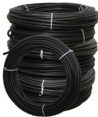
HDPE & LDPE Pipes