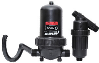
Water Filter 20mm - 80mm