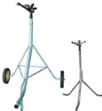
Sprinkler Stand 20mm & 50mm