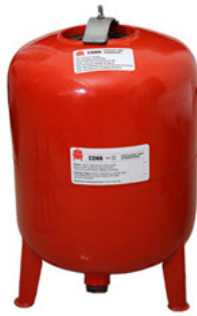
Fertilizer tank 145L