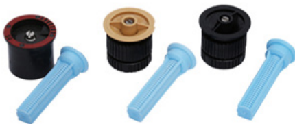
Sprinkler Nozzles 4 Van - 18 Van