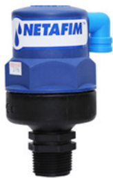
Air Valves 25mm & 50mm