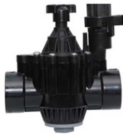
Solenoid Valves 25mm / 40mm / 50mm