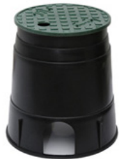
Valve Boxes 6" / 10" / 20"