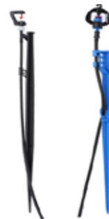
Microjet Sprinklers 90D, 180D & 360D