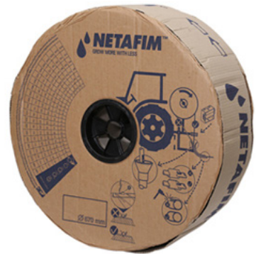
Disposable 16mm Streamline & 16mm Supertyphon

Dripper Spacing — 0.2m / 0.3m / 0.4m / 0.5m / 0.6m / 0.75m / 1m