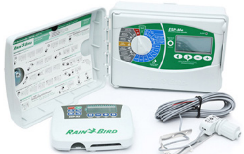
Rain Bird Controllers Available in 4STN, 6STN, 8STN