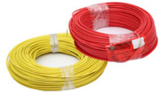
Panel Wire 0.5 & 1.5