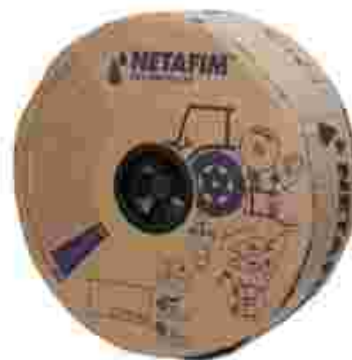
Disposable 16mm Streamline & 16mm Supertyphon

Dripper Spacing — 0.2m / 0.3m / 0.4m / 0.5m / 0.6m / 0.75m / 1m