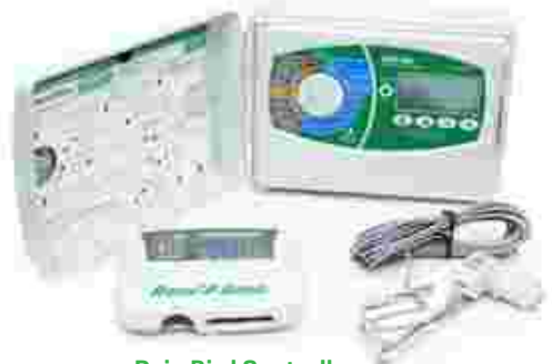
Rain Bird Controllers Available in 4STN, 6STN, 8STN