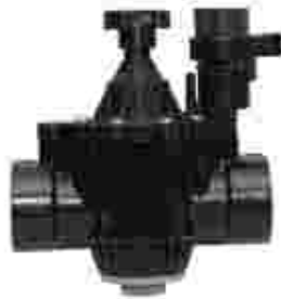
Solenoid Valves 25mm / 40mm / 50mm