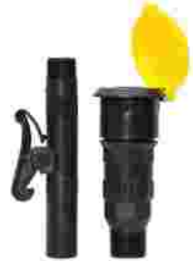
Turf Value & Turf Key 20mm & 25mm