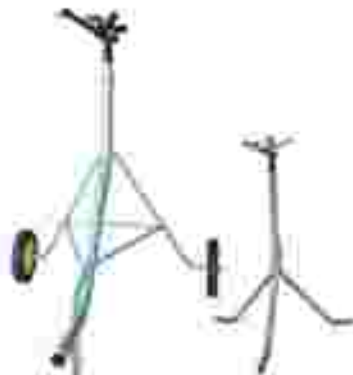
Sprinkler Stand 20mm & 50mm