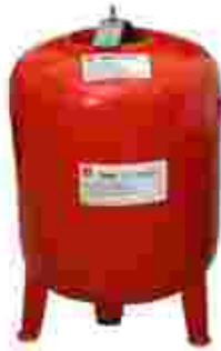
Fertilizer tank 145L