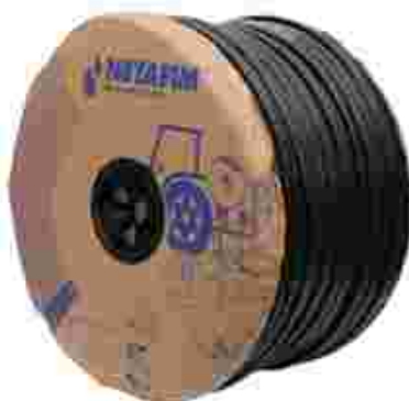
16mm Dripline [Aries] 500m & Accessories 16mm & 20mm Black Lines 100m