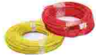
Panel Wire 0.5 & 1.5