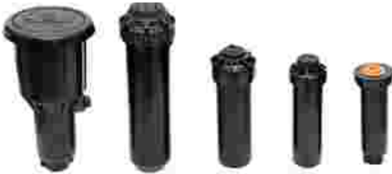
Sprinklers — Radius 0.9 m - 18 m | Flow Rate 0.35 - 4.9 M 3 /Hr | Pressure 1.7 - 4.1 Bar