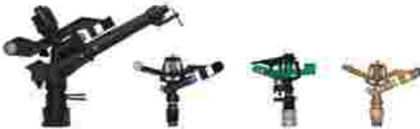
Impact Sprinklers — Available in Brass & Nylon | Sizes 15, 20 & 50mm Operating Pressure 1.7 - 4.1 Bar | Radius 8m - 30m Flow Rate 0.6 - 24 m 3 /Hr