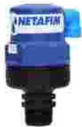
Air Valves 25mm & 50mm