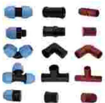
HDPE, Nylon and Full-Flow Fittings