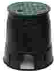
Valve Boxes 6" / 10" / 20"