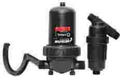
Water Filter 20mm - 80mm