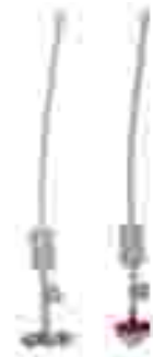
Coolnet & Spinnet [For Seedlings] Single & 4 Nozzles