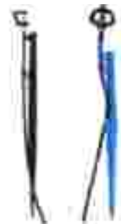
Microjet Sprinklers 90D, 180D & 360D