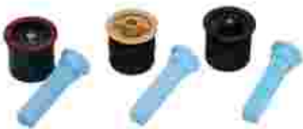
Sprinkler Nozzles 4 Van - 18 Van