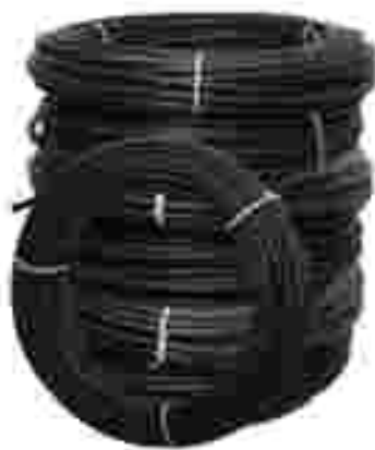
HDPE & LDPE Pipes